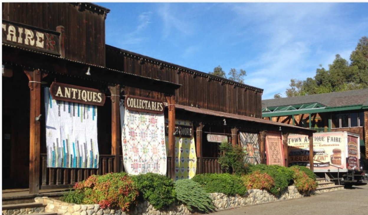
Old Town Temecula Quilt Show