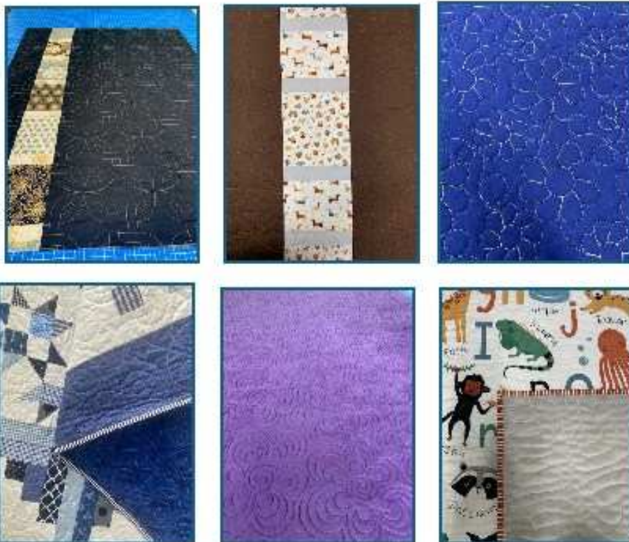
Examples of backings that make the quilting shine!

When planning your backing always consider the thread color you might choose for the front of your quilt and how it will look on the backing. A solid backing can really show off the quilting with the right thread choice.