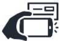
photo of each auction item that may be sent to me by email but be sure to say "Auction Item Photo" in the subject line. The form may be found elsewhere in this newsletter or call me.