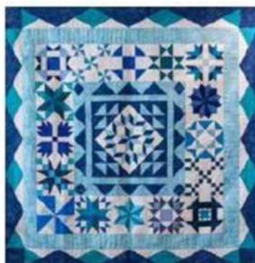
"Rhapsody in Blue" Opportunity Quilt