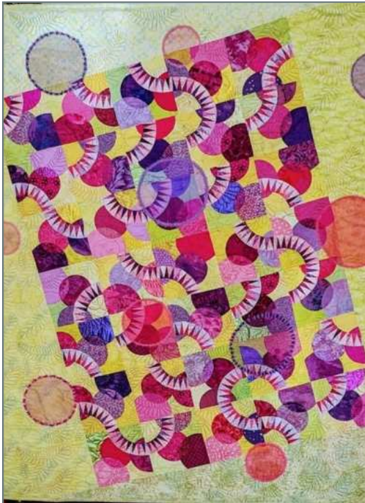
2024 Opportunity Quilt— Emilee's Bubbles