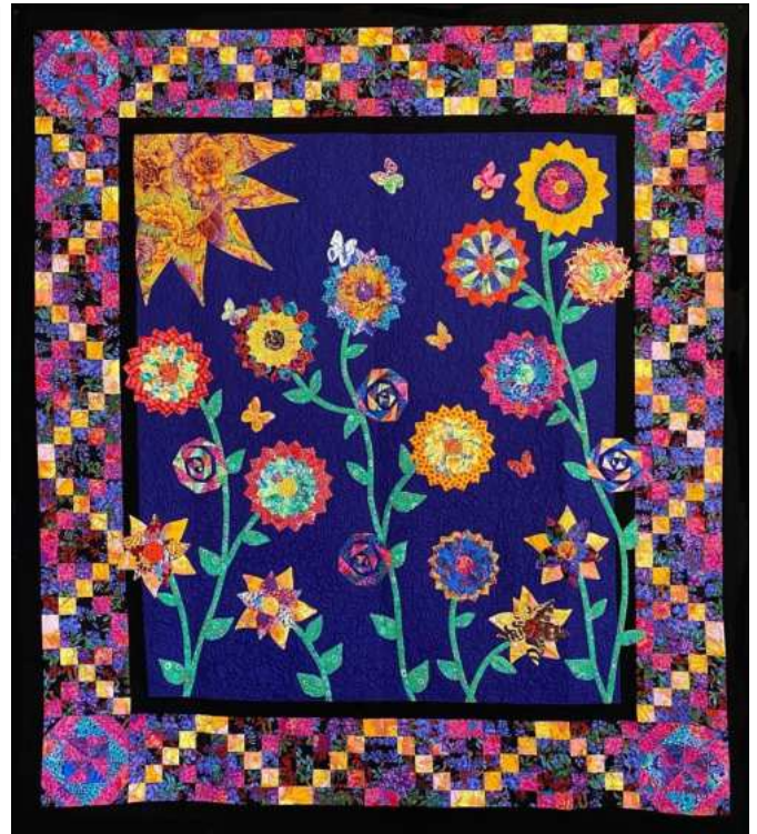
2024 Opportunity Quilt—Garden Party